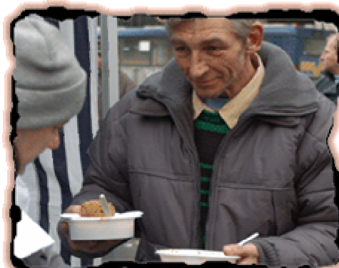
You can make a difference to help these people back to society.