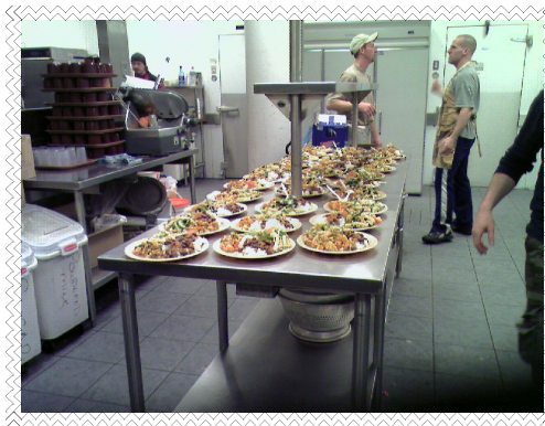
Meals prepare with fresh ingredients and cook on the spot.