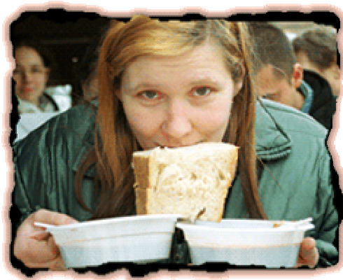
Bringing the most nutritious meal to the needy.